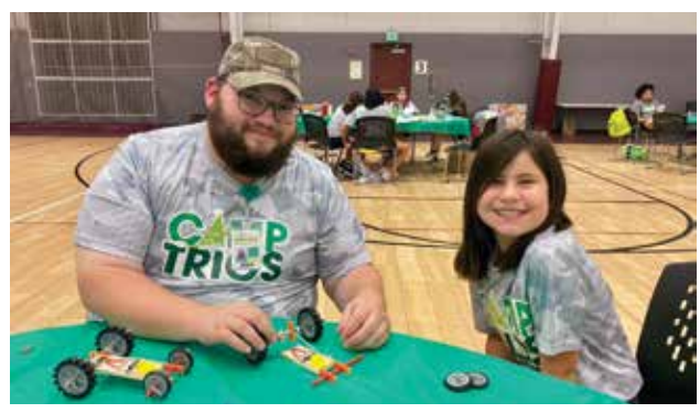
Trios Health hosted Camp Trios, a summer camp for children with diabetes.